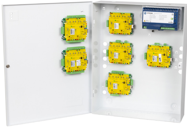
6ACCESS-12 (boards not included)