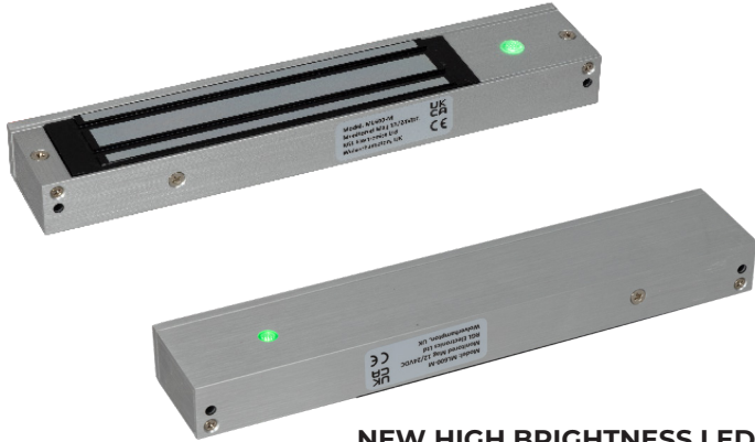
NEW HIGH BRIGHTNESS LED