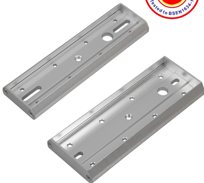
AH600 / AH1200