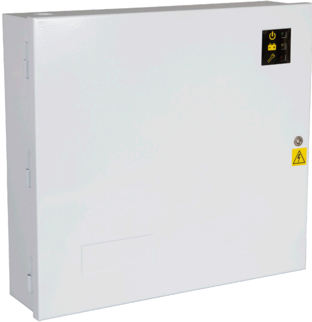
24V POWER SUPPLY