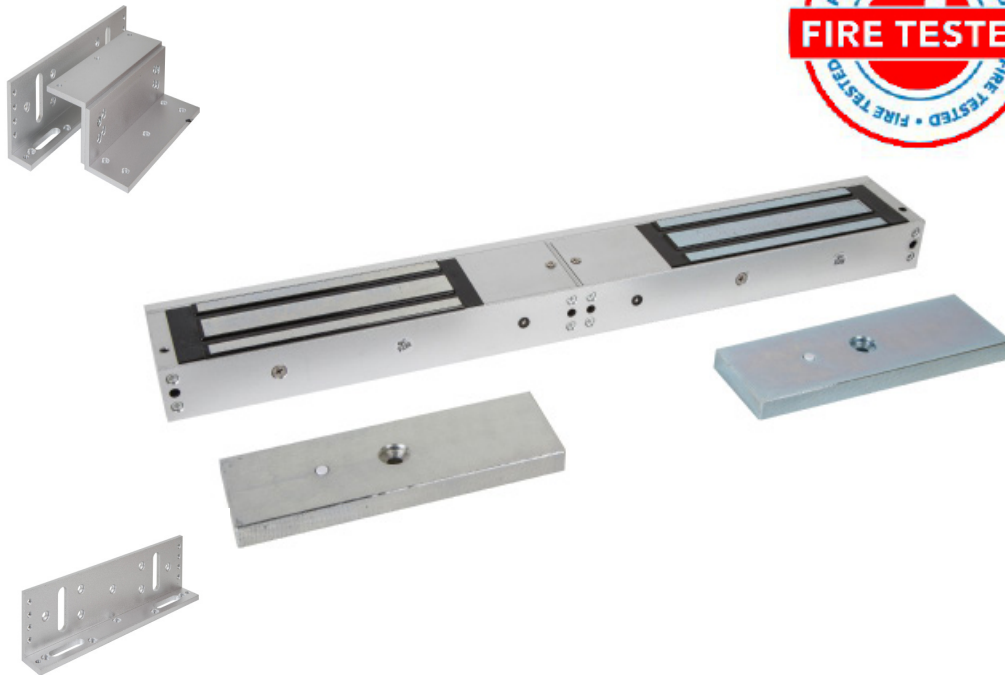
Double Standard Magnetic Lock (1200lb)