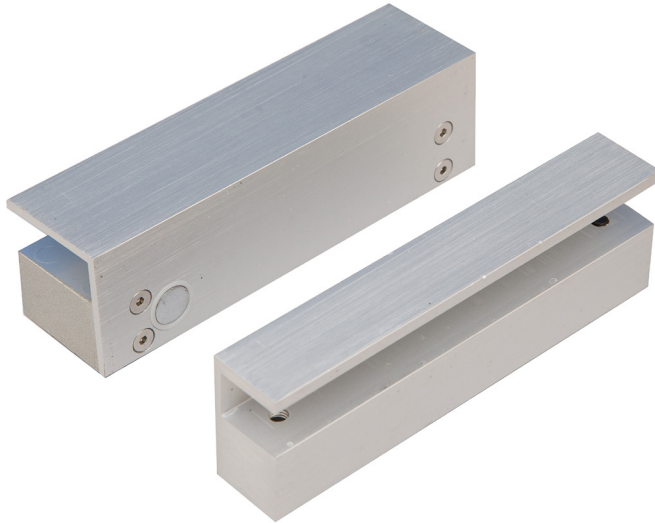
Glass Door Drop Bolt