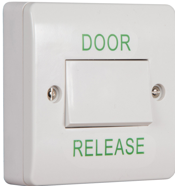
LARGE RETRACTABLE SWITCH