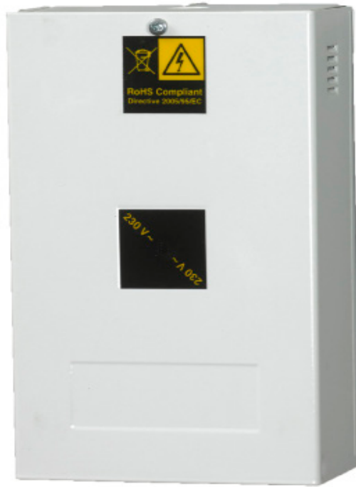
CCTV Power Supply 24v